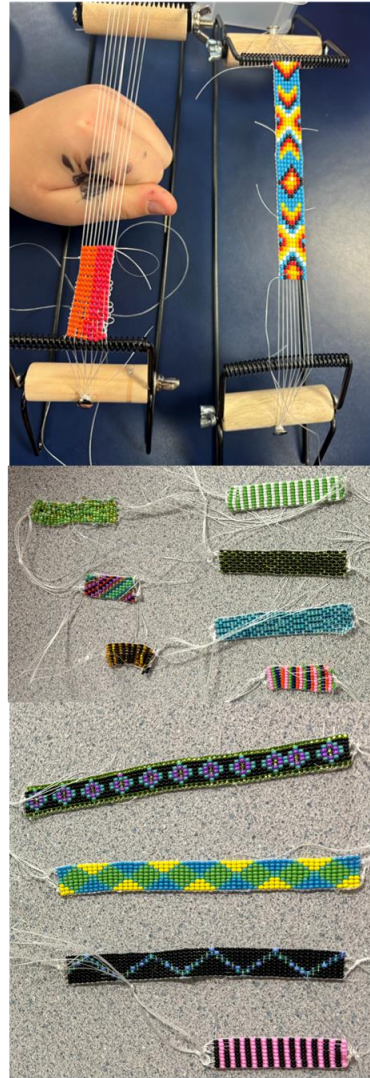
Bracelets made by Grade 6/7 Glenview Elementary students in November!